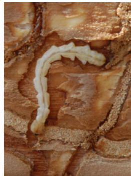
EAB larvae damage the vascular system of the tree as they feed, which interferes with movement of systemic insecticides in the tree.

greater than 15 inches at a rate that is twice as high (2× rate) as the rate used for smaller trees (1× rate). In an OSU study in Toledo conducted from 2006–2014, imidacloprid soil drenches effectively protected ash trees ranging from 15–22 inches in diameter when applied at the 1× rate in spring, or at the 2× rate when applied in either the spring or fall. These treatments were effective even during years of peak pest pressure when all of the untreated trees died. Trees treated in fall with the 1× rate, however, declined and had to be removed.